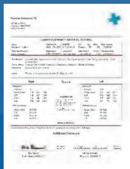
Venous Report and Test Summary